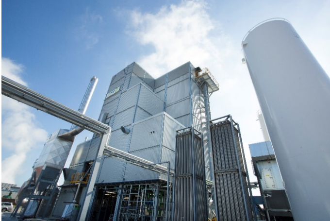
Figure 2: Empyro factory

Also, the oil is polar due to its high content of water and oxygenated compounds. The composition of pyrolysis oil may change during storage. Pyrolysis oil is not chemically stable, which leads to aging. When the oil is heated, the aging rate increases. However, the oil can be stabilized by catalytic (hydrogen) treatment, addition of solvent, and esterification.