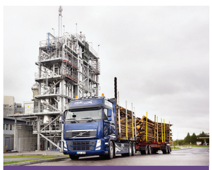
BioDME plant with DME log truck in foreground

The DME demonstration plant in Piteå, Sweden, which was put into operation in 2010, is the only gasification plant worldwide producing high-quality synthesis gas based on 100% renewable feedstocks. The raw material used is black liquor, a high-energy residual product of chemical paper and pulp manufacture which is usually burnt to recover the spent sulphur.